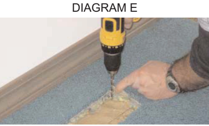
DRILL OUT CORNERS WITH 3/8" DRILL BIT. IMPORTANT: ROUGH-IN OPENING FOR OUTER SLEEVE MUST NOT EXCEED 4 5/16" X 12 5/16".