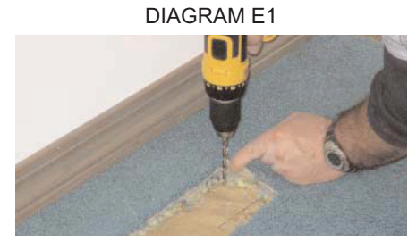
DRILL OUT CORNERS WITH 3/8" DRILL BIT. IMPORTANT: ROUGH-IN OPENING FOR BLOWER HOUSING MUST NOT EXCEED 4 1/16" X 12 5/16".