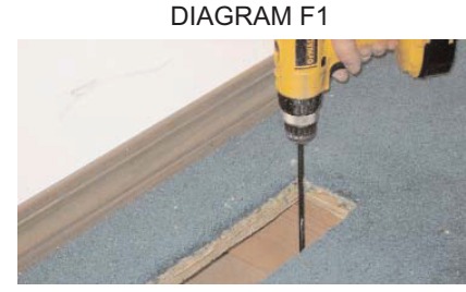
IF CEILING BELOW IS FINISHED, DRILL (4) 1/4" HOLES STRAIGHT DOWN THROUGH CEILING USING EACH OF THE 4 CORNERS OF BLOWER HOUSING CUT OUT AS A GUIDE.