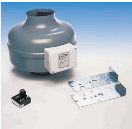
DVK 100B-C Kit with Current Sensor