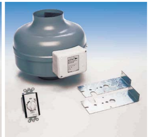
DVK 100B-T Kit with Timer