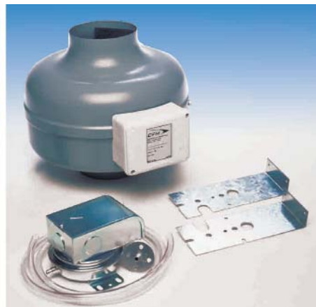
DVK 100B-P Kit with Pressure Switch