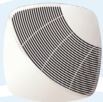
MS Series Fan-Light

Available with energy-saving fluorescent bulb.